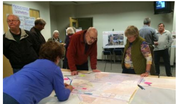
First Series of Public Workshops