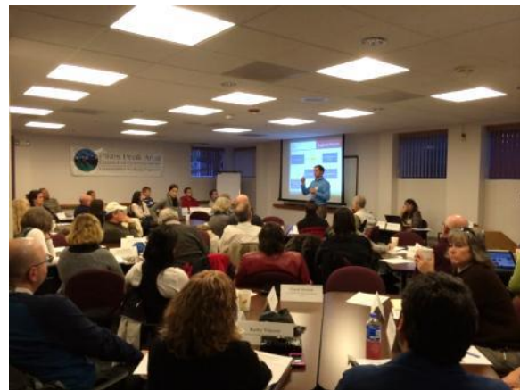
Technical and Stakeholder Task Force Meeting